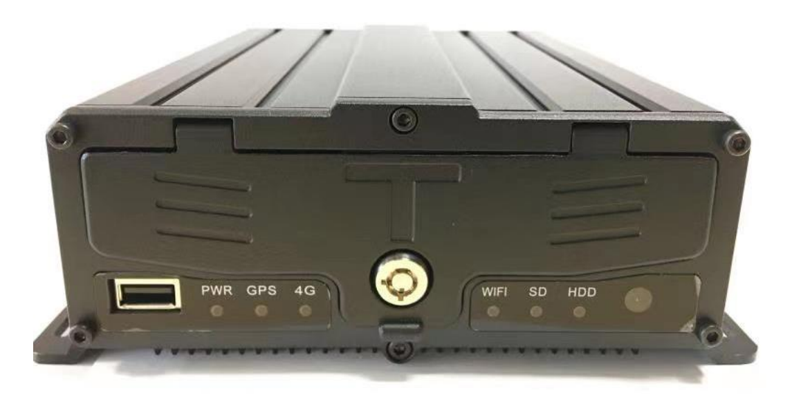
图 1 前面板示意图