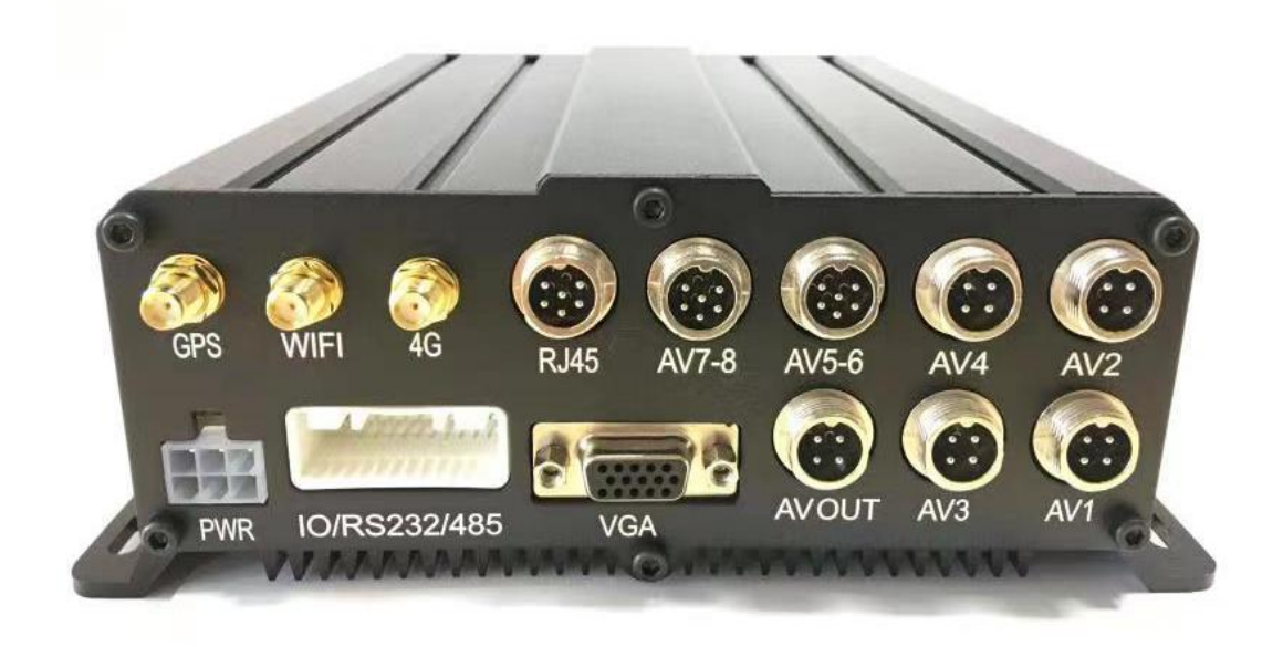
Figure 2 Schematic diagram of the rear panel