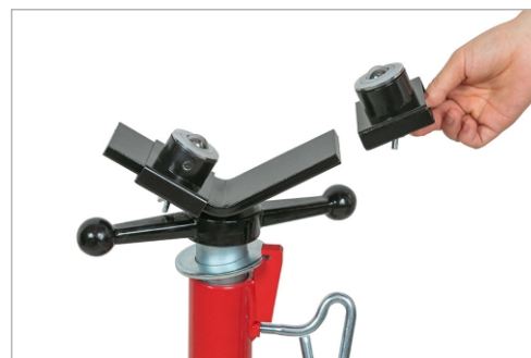
A ball head