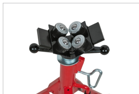
B ball head