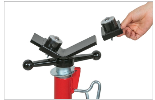
A ball head