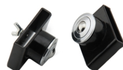
A ball head