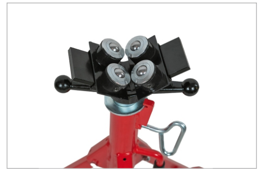
B ball head