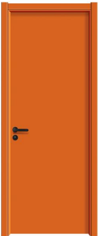
[G]爱马仕橙 Hermes Orange