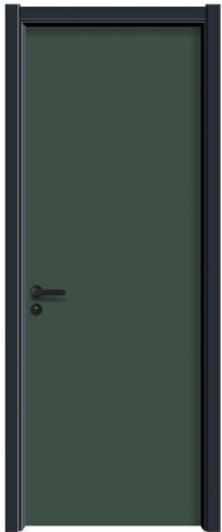
[E]爱马仕绿 Hermes Green