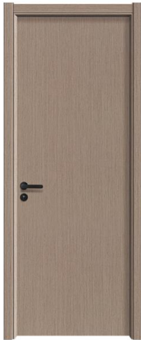
[H]流光岁月咖啡 Streamer Coffee