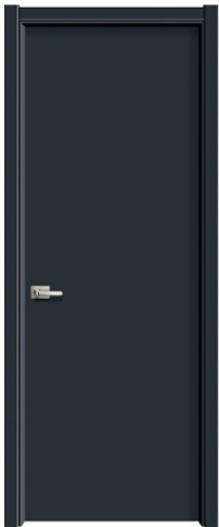
[F]爱马仕灰 Hermes Grey