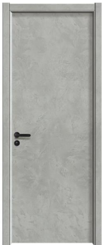
[A]炫彩灰 Colorful Grey