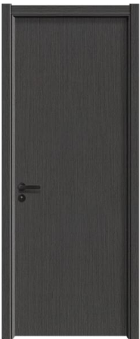
[C]流光岁月深灰 Streamer Dark Grey