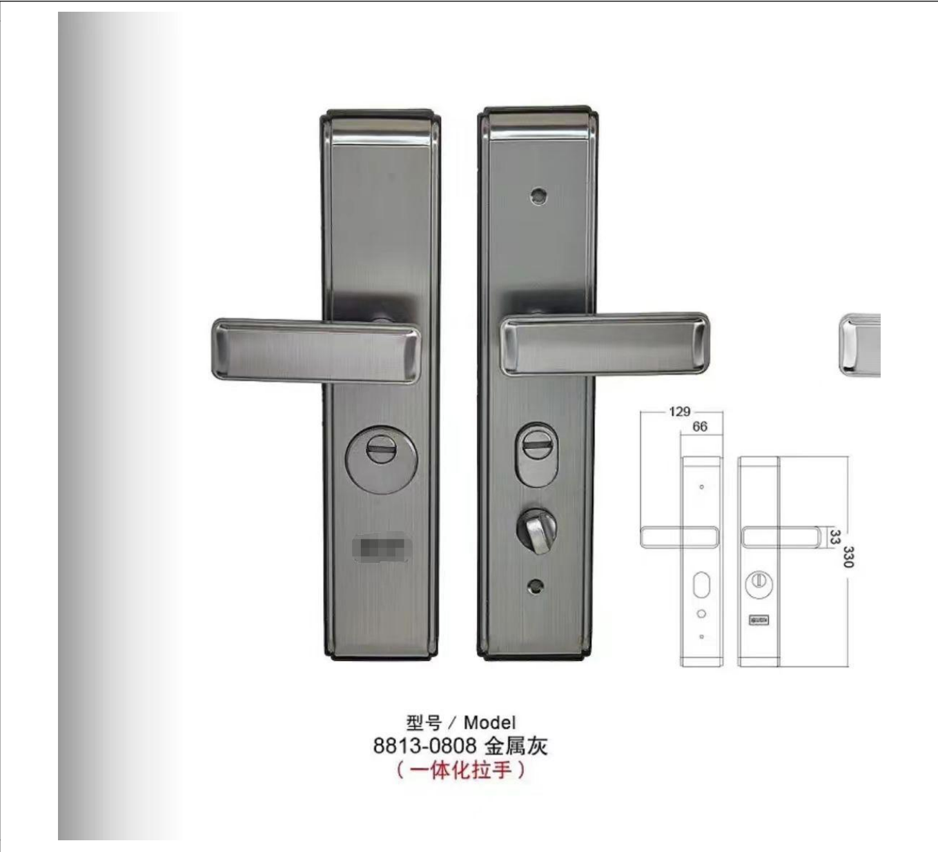
型号 / Model 8813-0808 金属灰 (一体化拉手)