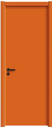
[G]爱马仕橙 Hermes Orange