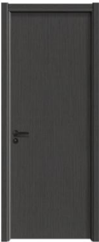
[C]流光岁月深灰 Streamer Dark Grey