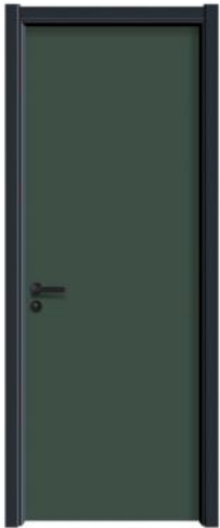
[E]爱马仕绿 Hermes Green