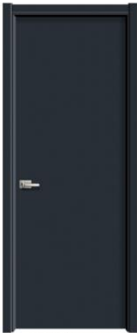
[F]爱马仕灰 Hermes Grey