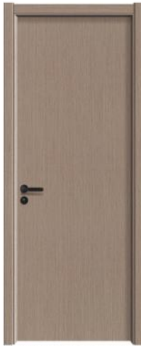
[H]流光岁月咖啡 Streamer Coffee