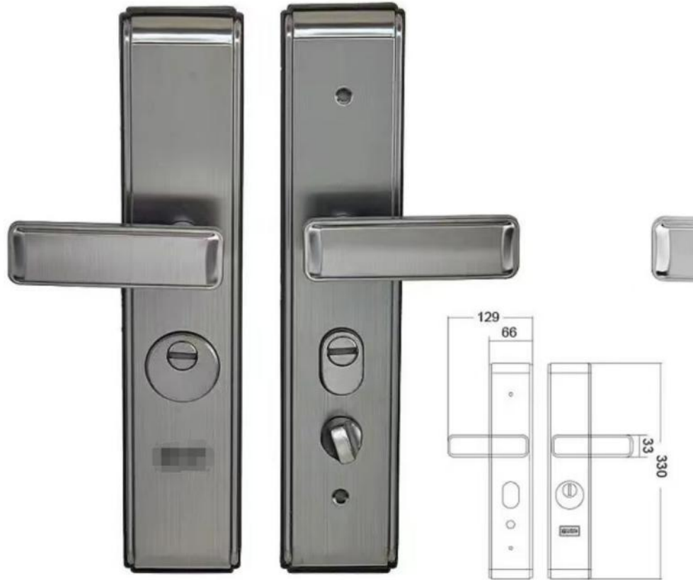
型号 / Model 8813-0808 金属灰 (一体化拉手)