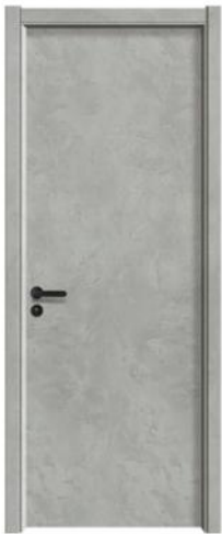
[A]炫彩灰 Colorful Grey