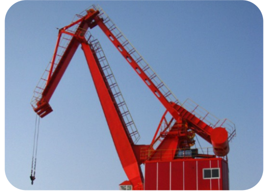
Lifting or hoisting equipment