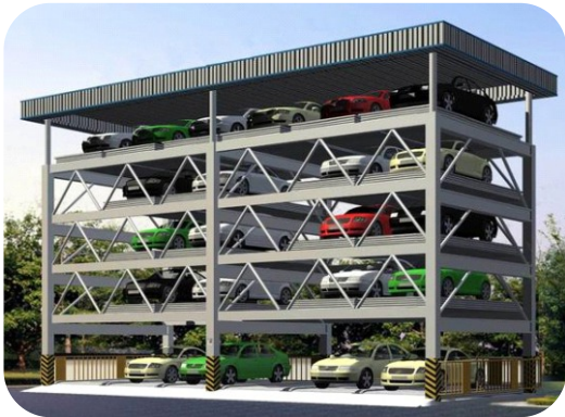
Automated parking system