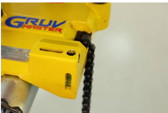
Figure 4 – HC-1X Pipe Hole Cutter Level Vial 2