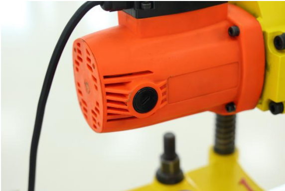
Figure 5 – Brush Placement - Brushes Position