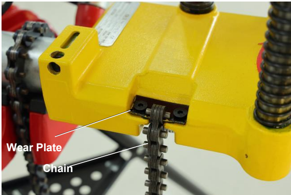
Figure 2 – Hooking the HC-1X Chain