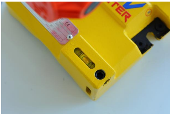
Figure 3 – HC-1X Pipe Hole Cutter Level Vial 1