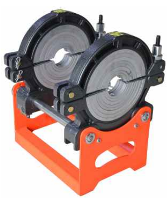
Model D2 series