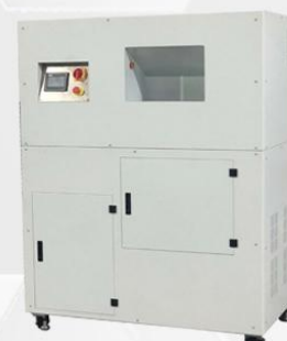
SPD300 Professional chip & circuit board disintegrator Final particle size: under 1*1mm 2 or customized Working capacity: more than 20 kg per hour