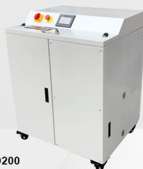
SPD200 Chip & circuit board disintegrator Final particle size: 1*1mm 2 - 3*3mm 2 Working capacity: 5-10 kg per hour