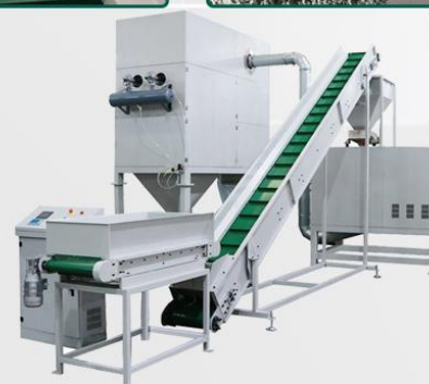
SPD750 Industrial PCB, Chip, electronic component & circuit board disintegrator Final particle size: under 1*1mm 2 or customized Working capacity: more than 200 kg per hour