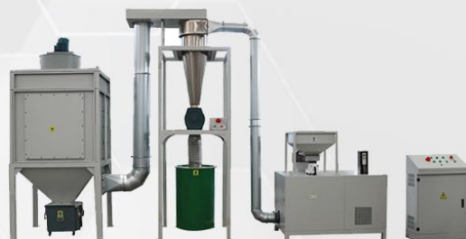
SPD350 Chip, electronic component & circuit board disintegrator Final particle size: under 1*1mm 2 or customized Working capacity: more than 80 kg per hour