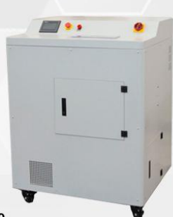
SPD150 CD, chip, circuit board disintegrator Final particle size: under 1*1mm 2 or customized Working capacity: around 5 kg per hour