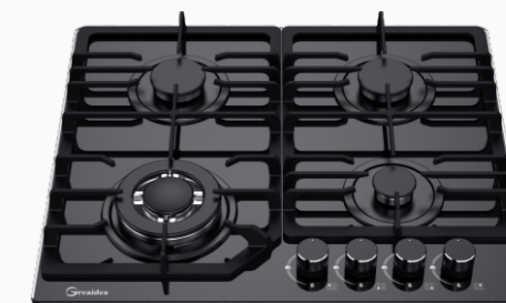
MGBG-604T BL ● / WH ○ / IV ○