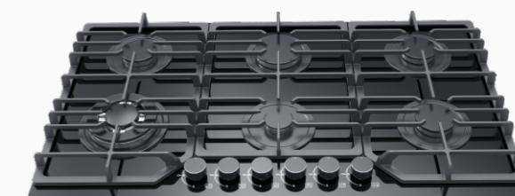
MGBG-876T BL ● / WH ○ / IV ○