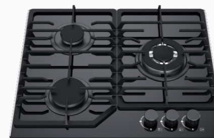
MGBG-603T BL ● / WH ○ / IV ○