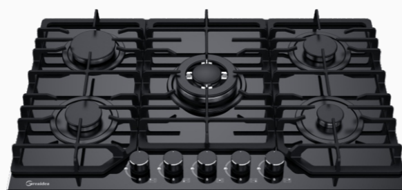
MGBG-775T BL ● / WH ○ / IV ○