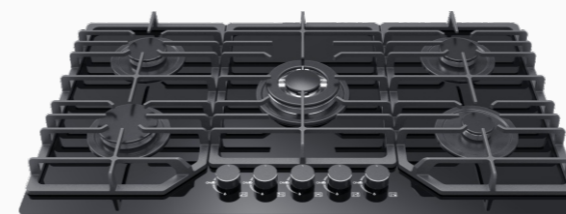
MGBG-875T BL ● / WH ○ / IV ○