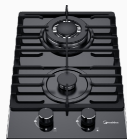
MGBG-302T BL ● / WH ○ / IV ○