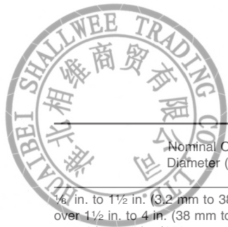
TABLE 6 Permissible Variations in Diameter