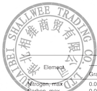
TABLE 2 Continued