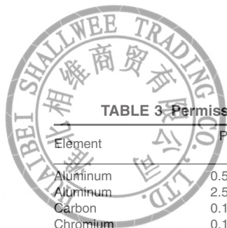
TABLE 3 Permissible Variations in Product Analysis