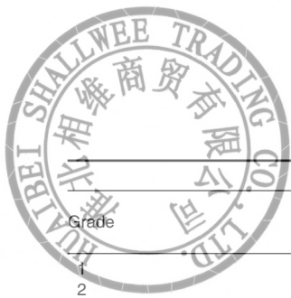
TABLE 4 Tensile Requirements A