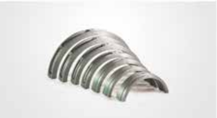
RIYANG aluminum reducing inserts