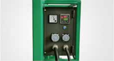
All connection sockets at the back of electrical cabinet