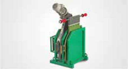
Unique Teflon coated heating plate in support bracket