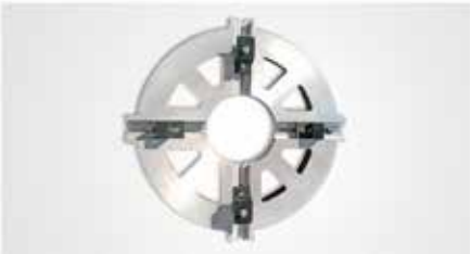
Aluminum stub end device