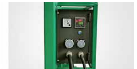
All connection sockets at the back of electrical cabinet