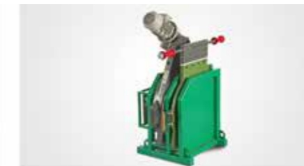
Unique Teflon coated heating plate in support bracket