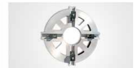
Aluminum stub end device