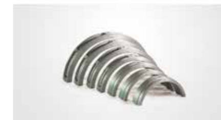
RIYANG aluminum reducing inserts