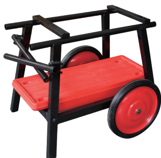
672A stand (optional)