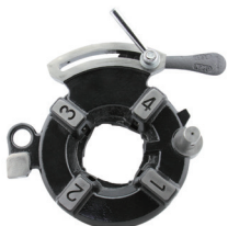
428 die head