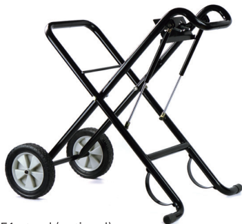
651 stand (optional)