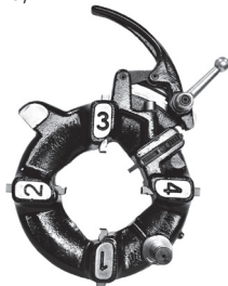
432 die head