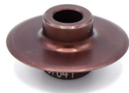
reinforced cutting wheel