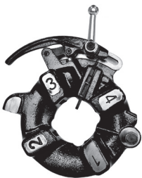
424 die head