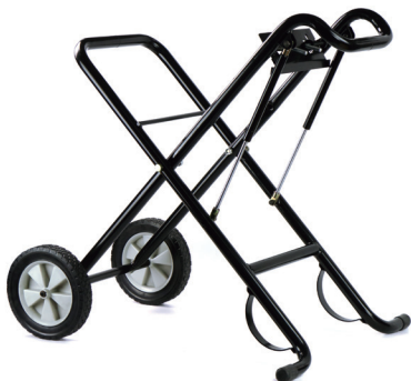
651 stand (optional)