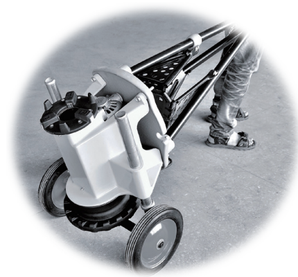
Model SQ50D with "T" Transporter (for optional)