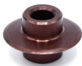
reinforced cutting wheel