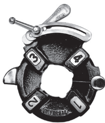
425 die head