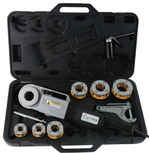
Model SQ30-2B with Support Arm, Die Heads and Carrying Case