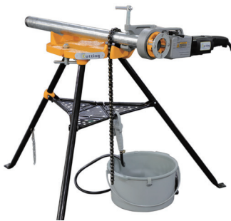
Model SQ30-2B operating