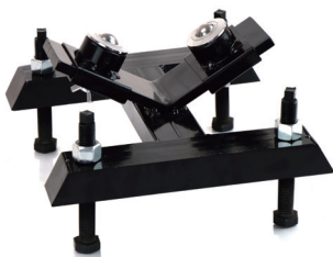
Ball Bearing Pipe Support