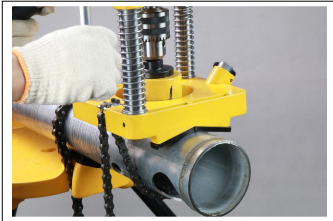
Cutting in process

Once the hole saw is in contact with the pipe, continue to apply firm pressure. Depending on the size and wall thickness of the pipe and the size of the hole being cut, the hole saw may need to be retracted slightly at times for chip removal. If needed, the Hole Cutting Tool can be shut off and a small amount of appropriate cutting lubricant applied to the work piece. Do not apply lubricant while the tool is running, this increases the risk of entanglement. Take appropriate steps to prevent the lubricant from dripping or being thrown during use. As the hole saw moves through the pipe and as the cut is completed, there will be an interrupted cut at times. Decrease pressure as this occurs to help prevent jamming of the hole saw.