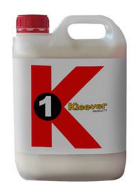
Vitrification Liquid For Dark Marble