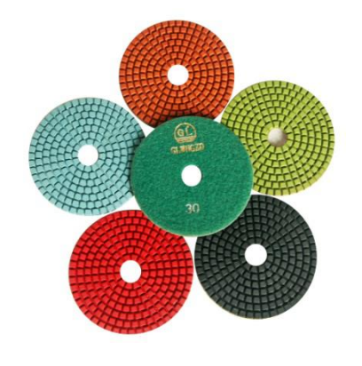
Dry Polishing Pads