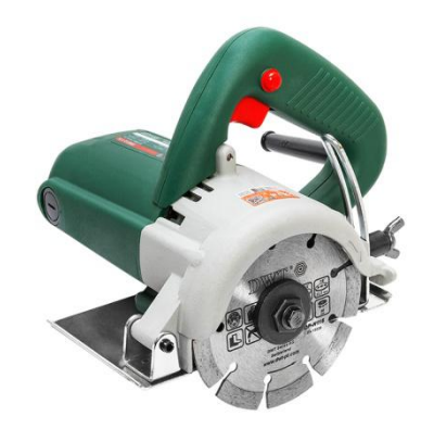
Marble Cutting Machine