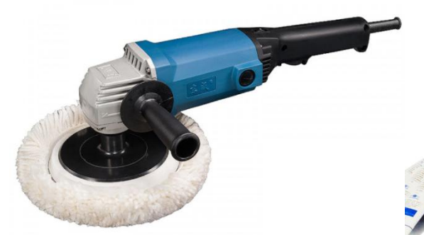
Portable Polishing Machine