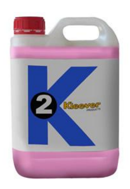
Pink Liquid Crystallizer