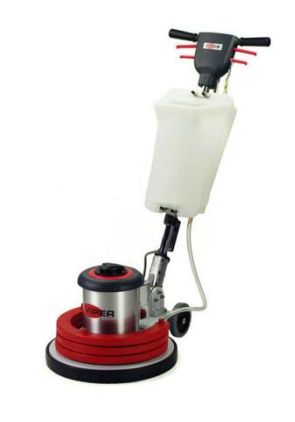
Polishing & Grinding Machine