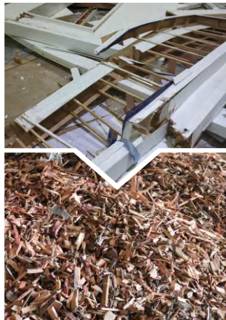
Waste wood, board