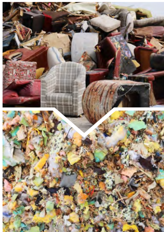
Mattresses and Bulky waste