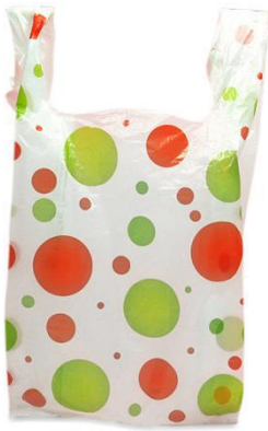
Full printing bag