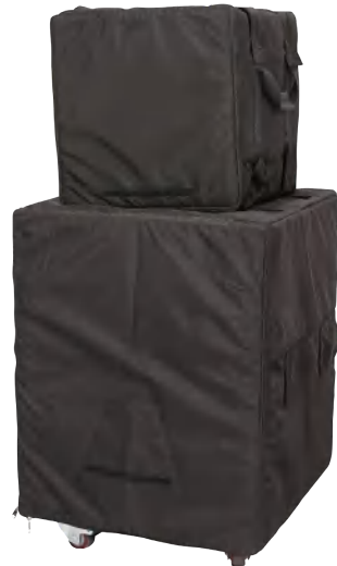
With Bag (selectable)