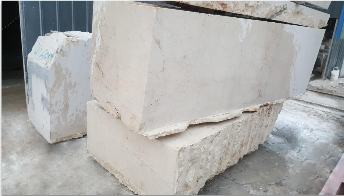
Spain Crema Marfil