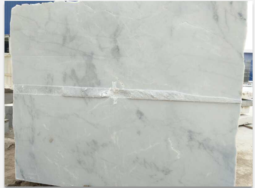
Hunan White Marble