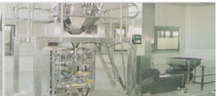
Automatic barrel packing machine