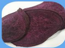
VF Purple Potato