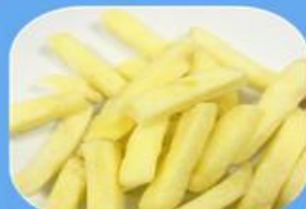
VF Potato Strip