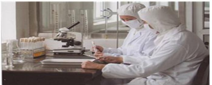
Quality controlling lab