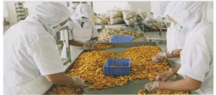
Automatic oil temperature control unit Semi-finished products chosen