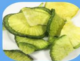
VF Radish Slice