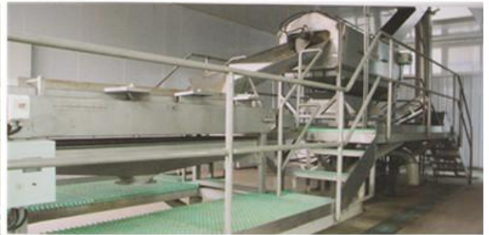
Pretreatment of CNC automatic production line