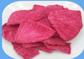
VF Red Radish