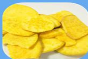
VF Sweet Potato