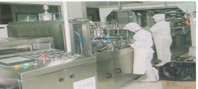
Automatic barrel packing machine