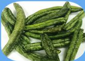
VF String Bean