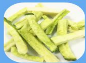
VF Radish Strip