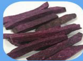
VF Purple Potato