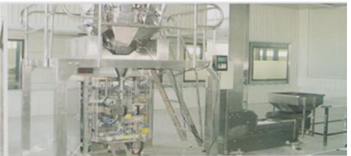
Automatic bag packing machine