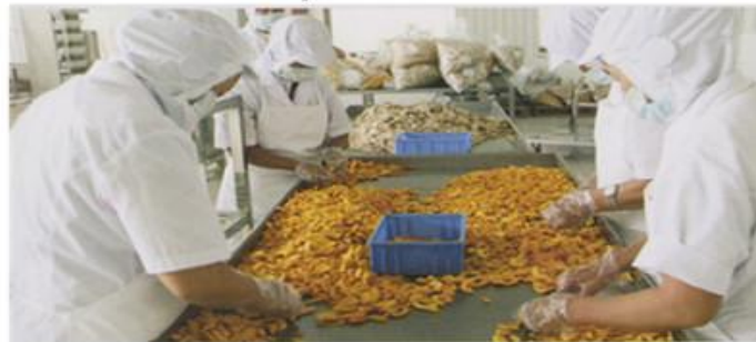
Automatic oil temperature control unit Semi-finished products chosen