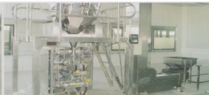
Automatic barrel packing machine