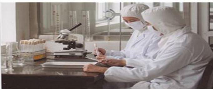
Quality controlling lab