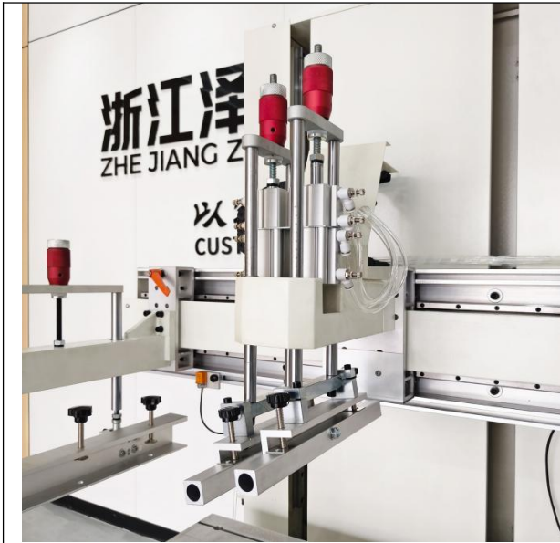
Print head structure