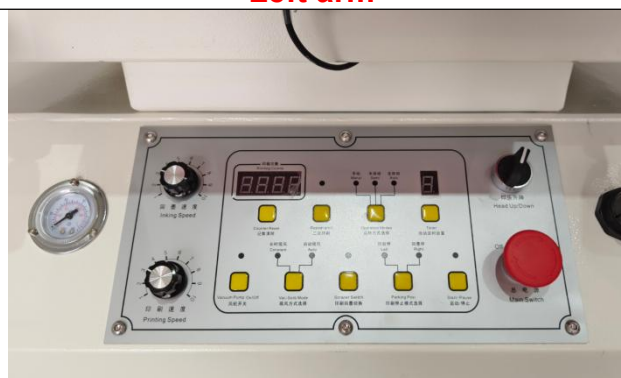
Control Panels and Switches