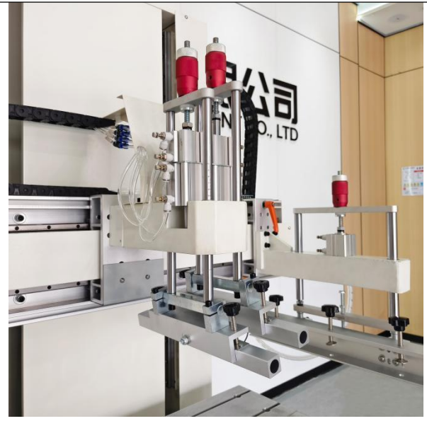
Print head structure