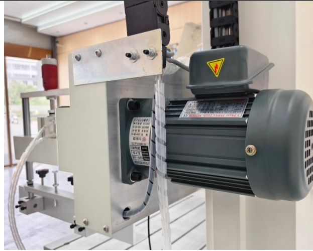
Print head left and right drive motors