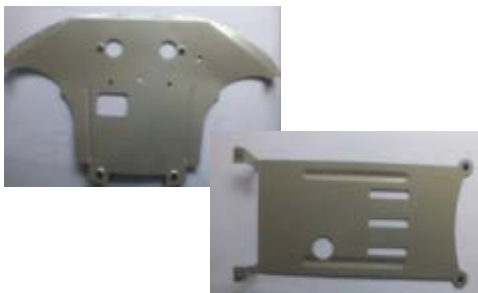
Part NO. :9032

Application: 13 300C Material: Aluminum magnesium Size: Specification: 2 pcs/set