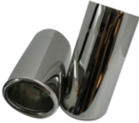
Part NO. :8049

Application: 11-13 S60 09-13 XC60 Material: #304 Stainless steel Size: Length: 138 Inlet size: 60 Specification: 2 pcs/set