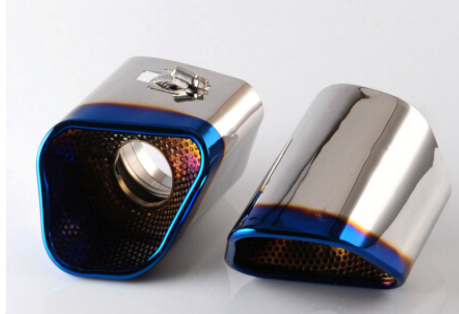
Part NO. : 7006

Application: S60 modified V40 modified Material: #304 Stainless steel Size: Length: 160 Inlet size: 65 Specification: 2 pcs/set