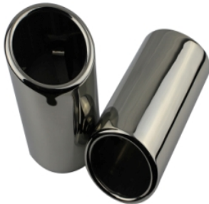
Part NO. :8006

Application: 11-13 XC90 Material: #304 Stainless steel Size: Length: 138 Inlet size: 67 Specification: 2 pcs/set