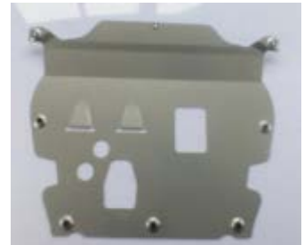
Part NO. :9071

Application: 09-13 S60 09-13 XC60 Material: Aluminum magnesium Size: Specification: 1 pc/set