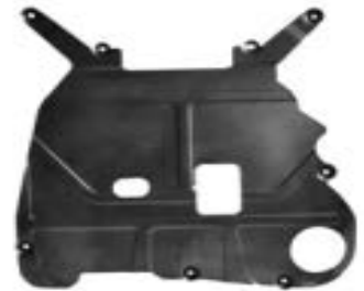
Part NO. : 9137

Application: Volvo XC90 Material: Aluminum magnesium Size: Specification: 1 pc/set