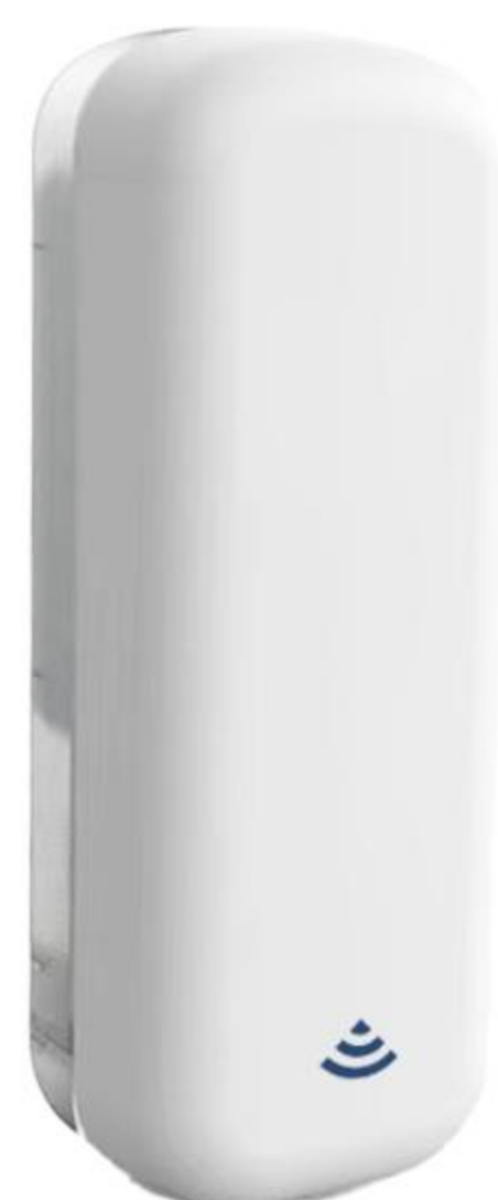
Small Automatic Hand Soap Dispenser