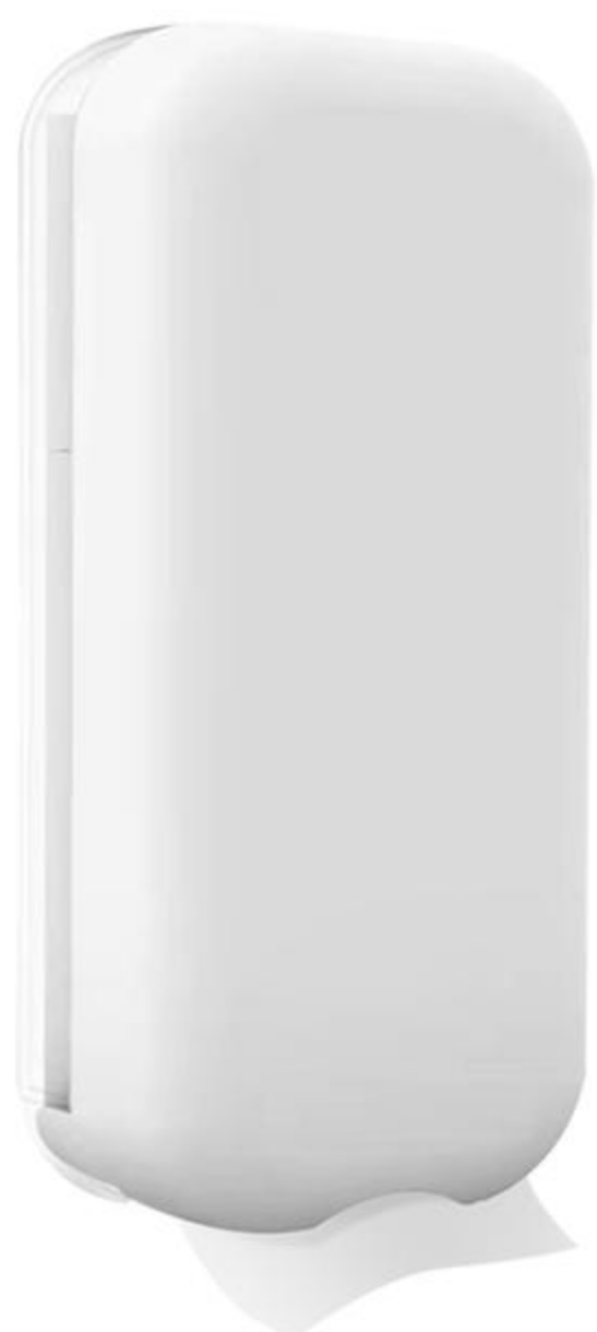
Small Folded Toilet Tissue Dispenser