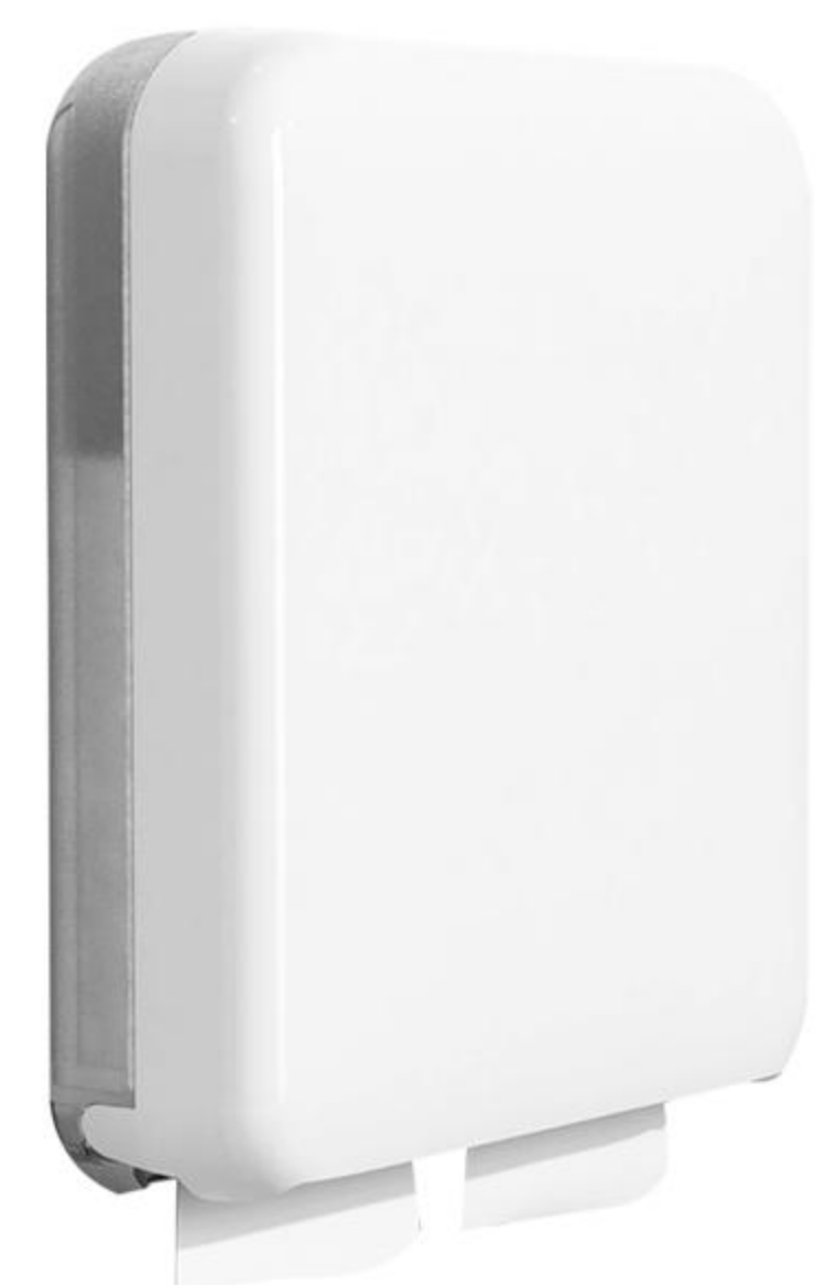
Double Folded Toilet Tissue Dispenser