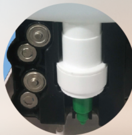
C size Alkaline Batteries