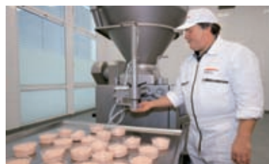
Automated dosing into containers