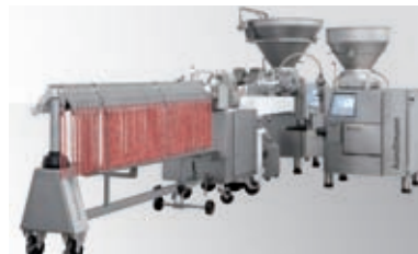
Continuous sausage production with the ConPro 200 system