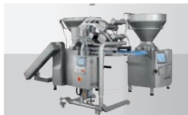
Automated co-extrusion and forming with Koex MFD system