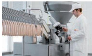
Sausage automation with AL systems