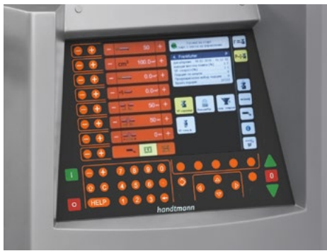
Control with colour display