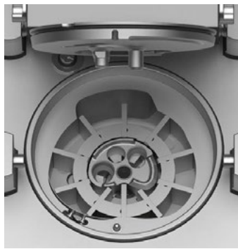
Vane cell feed system