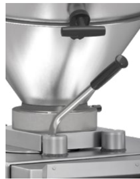
VF 610 plus advanced edition controls for ergonomic working and optimum level of hygiene