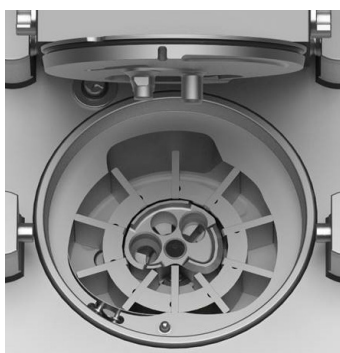
Vane cell feed system