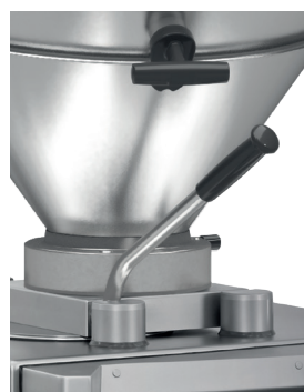
VF 608 B advanced edition controls for ergonomic working and optimum level of hygiene