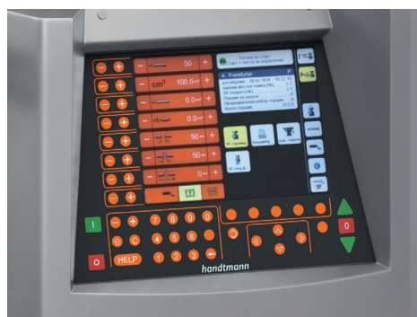
Control with colour display