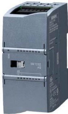
SIMATIC S7-1200, Analog output, SM 1232, 4 AO, +/-10 V, 14-bit resolution, or 0-20 mA/4-20 mA, 13-bit resolution