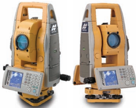
GPT-7500/GTS-750 Total Stations

Smaller, lighter, and faster, the GPT-7500/GTS-750 Total Stations are setting the new standard by which all total stations will be measured.