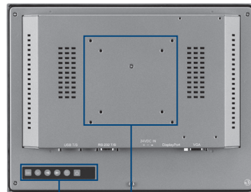
OSD Control Keys VESA Mount