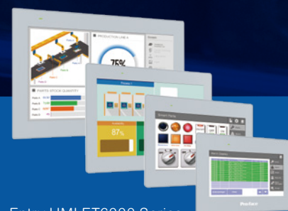
Entry HMI ET6000 Series

ET6000 Series has cost-effective and just enough functionality. And easy migration with software and hardware compatibility. Enhance your machine with features and good performance from HMI Centric concept.