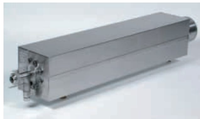
Optional unique in-line incinerator deactivates bacteria and spores as they are evacuated from the chamber.