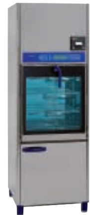
Typical small Getinge laboratory glassware Washer / Dryer.