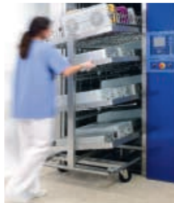
Getinge GEW Series Washer-Disinfectors are ideal for larger items such as animal cages and racks.

Whatever the application in the Life Sciences, Getinge has the solution for all your washing and sterilization applications. Consult Getinge for further information. www.getinge.com / info@getinge.com