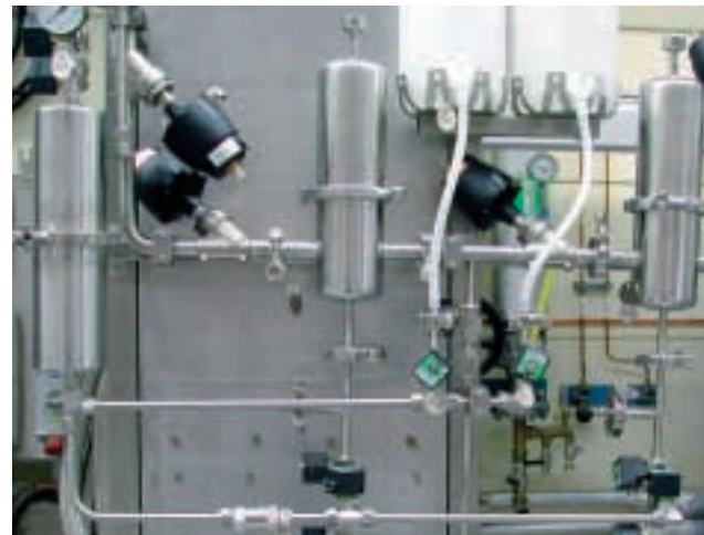
Optional dual sterile membrane filters arranged in series with optional in-place automatic WIT integrity testing.

Condensate is treated as described for Option 2.