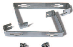
Wall Mounting Brackets [Included with harsh terminal]