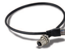
Ethernet Extension Kit [30139562]