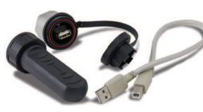
USB Extension Kit [301139560]