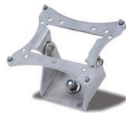
Positionable Bracket [22015188]