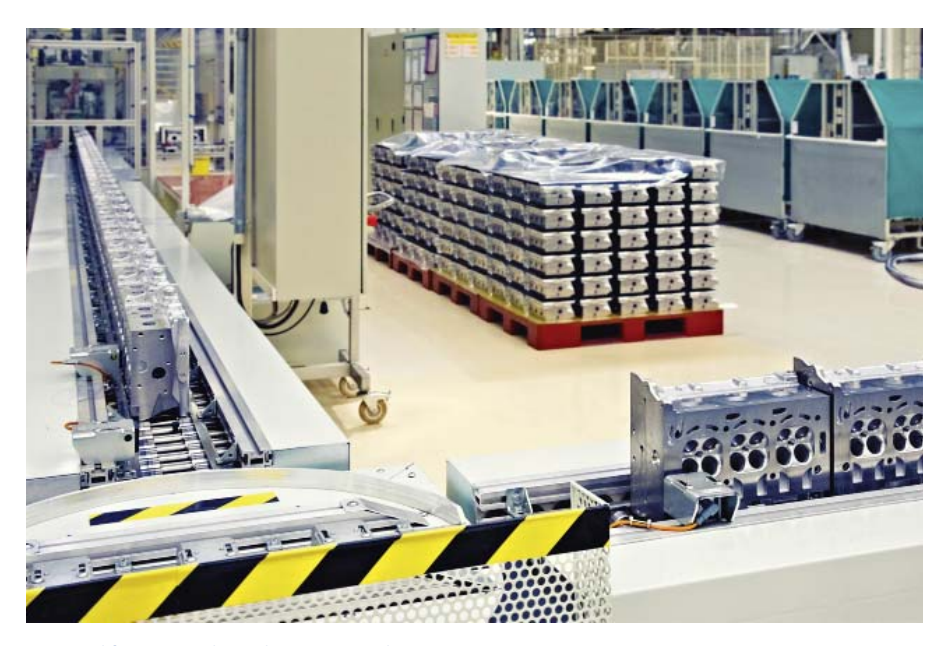
Test modifications without disrupting production

The GT14 is the latest addition to the GOT1000 series of HMIs, and sets new performance benchmarks for mid-range, 5.7" panel mount terminals. Boasting all the functions for which Mitsubishi Electric HMIs have become renowned, at prices which make them one of the most cost-effective on the market, these new operator terminals offer a host of new features and benefits, including an SD card slot, USB ports, Ethernet communications options, a TFT screen capable of displaying 65,536 colours, LED backlighting and analogue touch functionality.