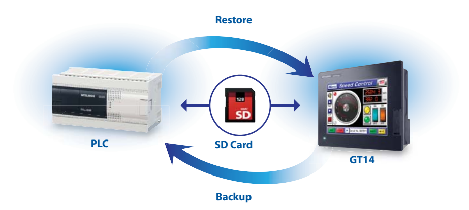
SD cards and USB's provide additional memory