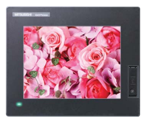
Enjoy the brightness of the GT14 TFT screen with 65536 colours and LED backlight

With internal memory expanded to 9 MB as standard, the GT14 can save up to 2,000 data points, while SD cards and USB memory sticks can provide additional memory for storing or transferring data. In addition, for increased flexibility, the GT14 is able to log data from multiple connected devices such as PLCs and temperature controllers. In addition, with its multi-channel function, a single GT14 can monitor and control up to two channels of factory automation products connected either over Ethernet or serial communications. For example, you could connect a PLC with a servo amplifier to one channel and a frequency inverter or temperature controller to the other, and then alternate between the two to monitor both devices.