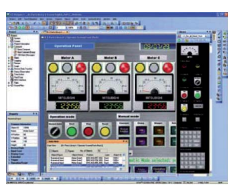
User friendly GT Designer HMI software