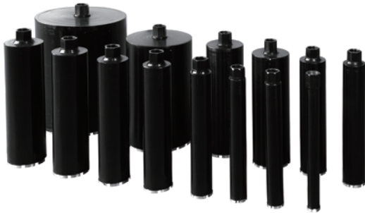
Diamond Core Drill Bits, Laser-Welded