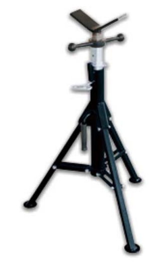
Model 1107 Pipe Support Stand for Roll Groovers for option.