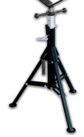
Model 1107 Pipe Support Stand for Roll Groovers for option.