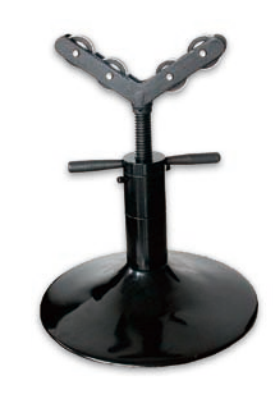
Model 1106 Pipe Support Stand