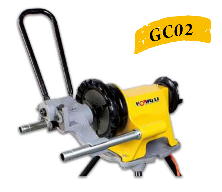
Model GC02 with SQ50D power drive