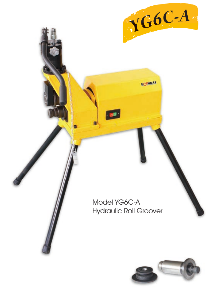
1 1/4"-1 1/2" Roller and Shaft