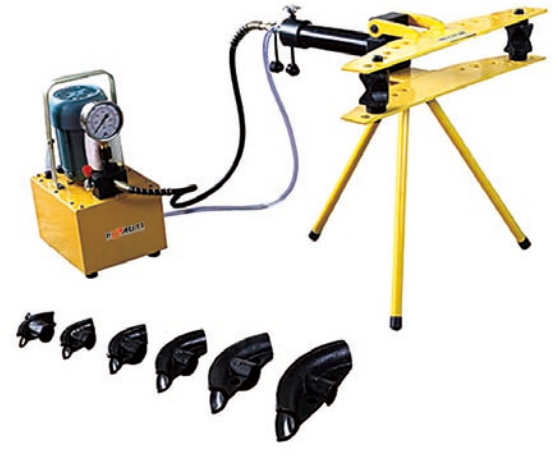
optional tripod stand