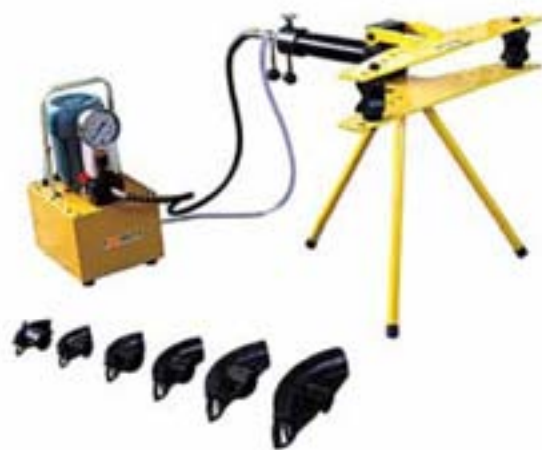
optional tripod stand