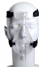
Full Face Mask

Skyfavor Medical, Favor for a better life