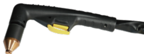
TP 130 MANUAL torch