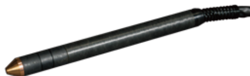
TP 130 CNC torch