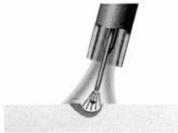
Arc setting: medium