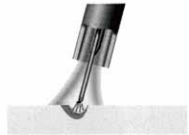
Arc setting: hard