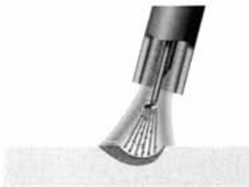
Arc setting: soft