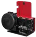
ARC-length-feedback wire feeder unit