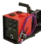
Cold wire feeder for TIG