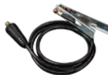
Electrode holder with 5 meter cable