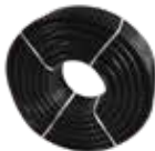
Intermediate cable kit 10 meter