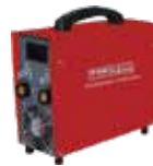
ArcMAN power divider